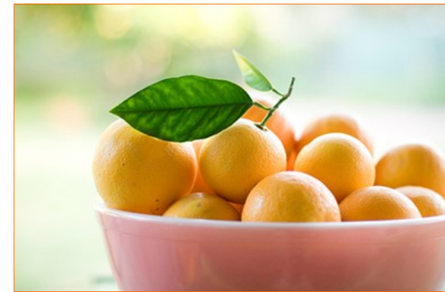
Chart your Course & Intentional Living

Peace and a sense of wellbeing don't come to us from a life free of challenges. They come from an inner certainty that you are living your best self and you are equipped to deal with what life has in store. Our mind, heart, spirit, and body are meant to work together to help us live out the fullness of who we are and what we are meant to do. Where are your blockers? How do you clear them and help all parts of yourself align with your true purpose?